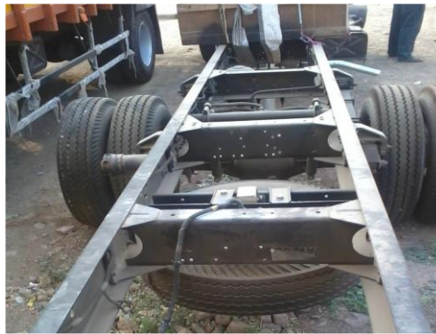
Figure 2 Actual C-beams chassis [17]

More recently in 2013, Hemant Patil et al. [17] and Hemant Patil and Sharad Kachave [1] presented stress analysis of a ladder type low loader truck chassis structure consisting of C-beams design using CATIA V5R10 and ANSYS, as shown in Figure 2. In order to achieve a reduction in the magnitude of stress at critical point of the chassis frame, side member thickness, cross member thickness and position of cross member from rear end were varied. Numerical results showed that if the thickness change is not possible, changing the position of cross member may be a good alternative. Computed results were compared to analytical calculation, where it was found that the maximum deflection agrees well with theoretical approximation but varies on the magnitude aspect. They concluded that it is better to change the thickness of cross member at critical stress point than changing the thickness of side member and position of chassis for reduction in stress values and deflection of chassis.