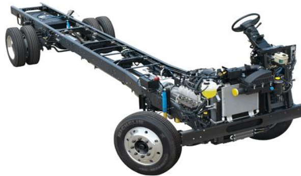
Figure1 Truck chassis assembly

In general, there are two approaches to simulate truck chassis using FEA methods: one is stress analysis to predict the weak points and the other is fatigue analysis to predict life of the frame. Recently, in quite a few of published papers, there are amount technical papers and some other sources which have been showed gradually upward trend. This overview selectively and briefly discusses some of the recent and current developments of the stress analysis of truck chassis. A number of analytical, numerical and experimental techniques are considered for the stress analysis of the heavy duty truck frames. Conclusion of the stress analysis in the vehicle chassis has been reported in literature. Finally, the scope of future work has been discussed after concluding on the obtained in this review paper.